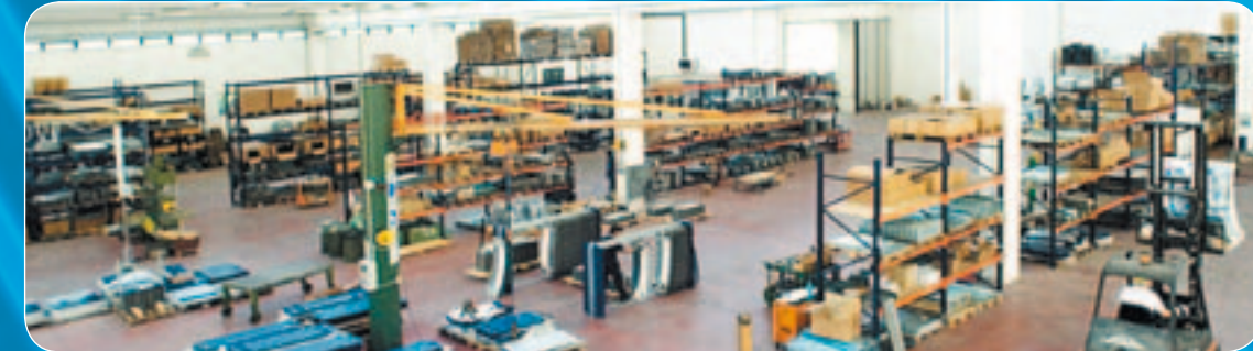
Assembly room at the Verona factory