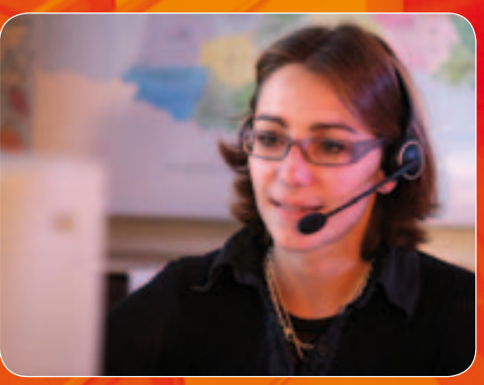
Our Customer Service department tracks your orders as soon as they are received. It is available 24/7 to provide you with information on their progress.

With our enormous stock of plates and gaskets, you can be sure that you will benefit from among the fastest delivery times in the industry. We even occasionally deliver spare parts for units that went out of production 20 years ago